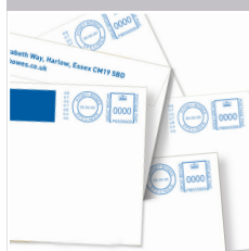
→ PROFESSIONAL IMAGE